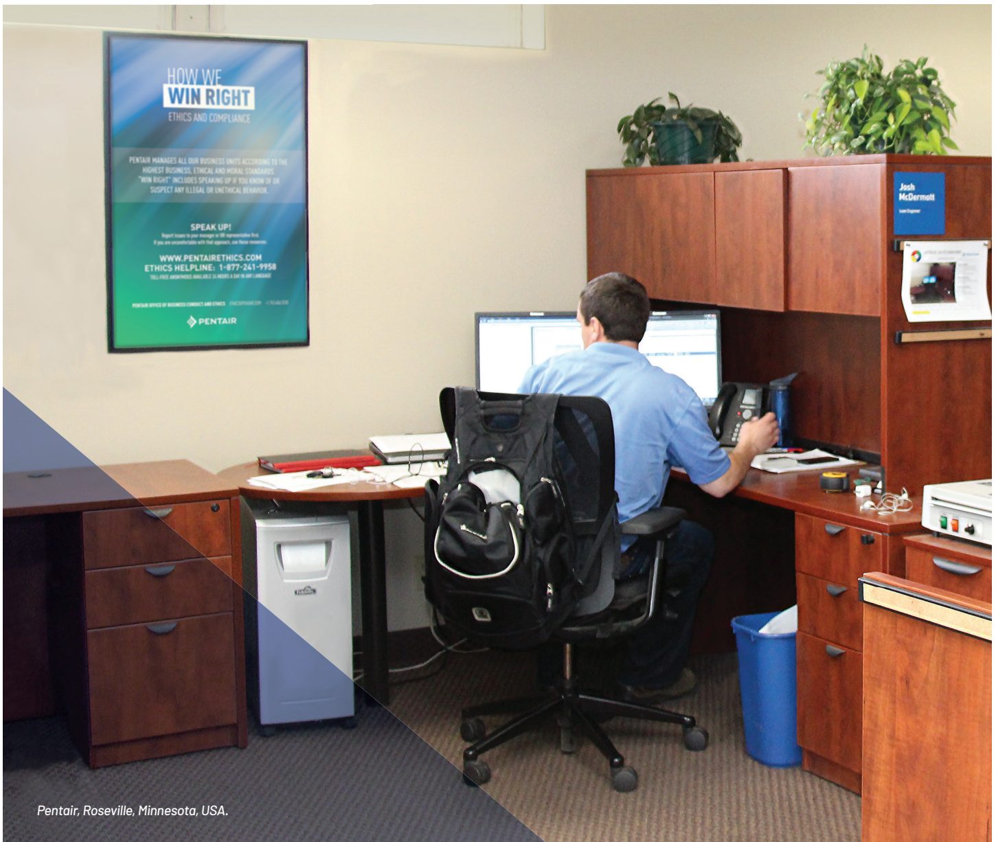
Pentair, Roseville, Minnesota, USA.

A: Pentair takes allegations of retaliation very seriously. This means educating employees and management on what retaliation looks like and ensuring they understand the consequences. If an allegation of retaliation is substantiated, the company will discipline the individuals involved up to and including termination.