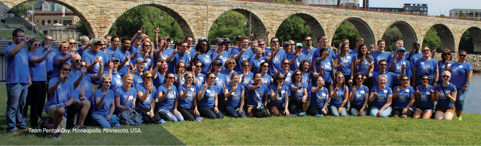
Team Pentair Day, Minneapolis, Minnesota, USA.