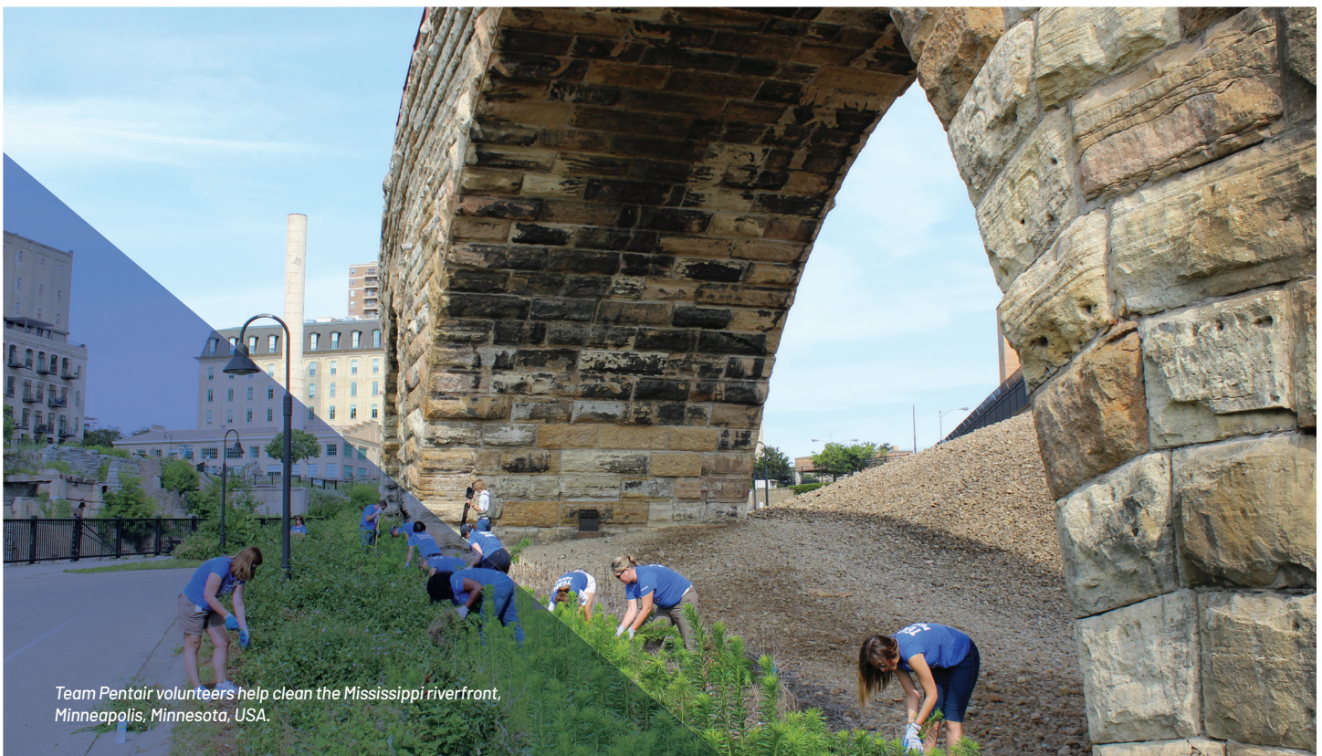
Team Pentair volunteers help clean the Mississippi riverfront, Minneapolis, Minnesota, USA.

Any waiver of the Code for executive officers or directors may be made only by Pentair's Board of Directors or by the Governance Committee of the Board.